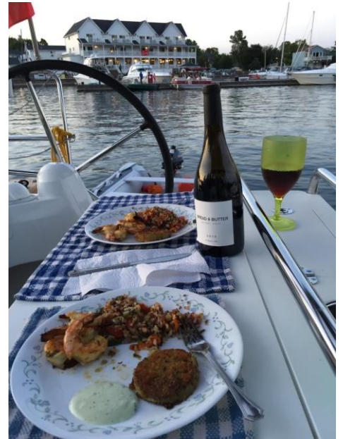
Dining at the Sportsman's Inn Killarney, ON

Jeanneau, Solvation and Unshackled rafting together at the South Benjamin Islands