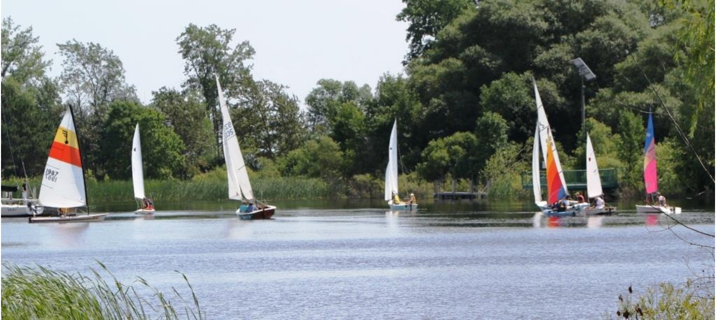
Small Sailboats in the Escanaba Harbor during the Wooden Boats Afloat Festival