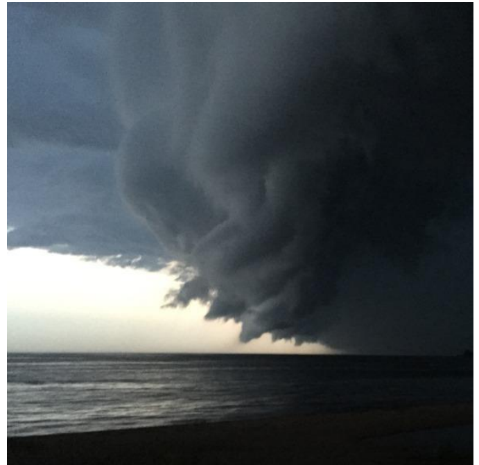
Storm south of Portage Point July 7 th 2017